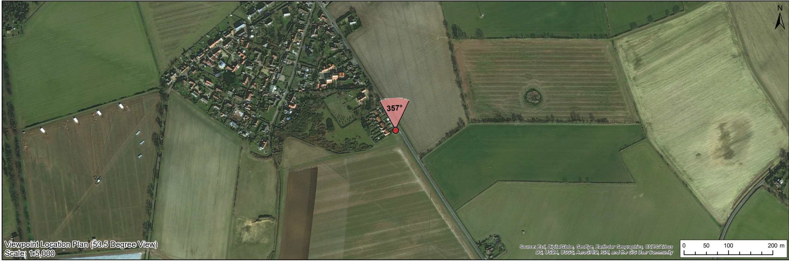
Viewpoint Location Plan (53.5 Degree View) Scale: 1:5,000