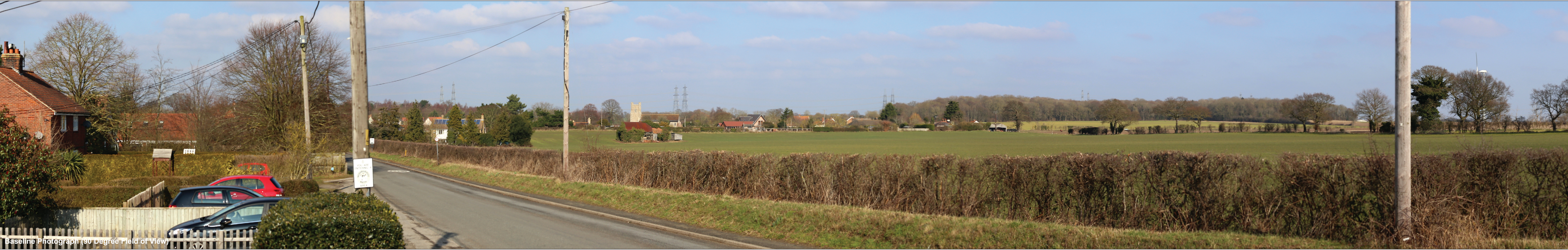
Baseline Photograph (90 Degree Field of View)