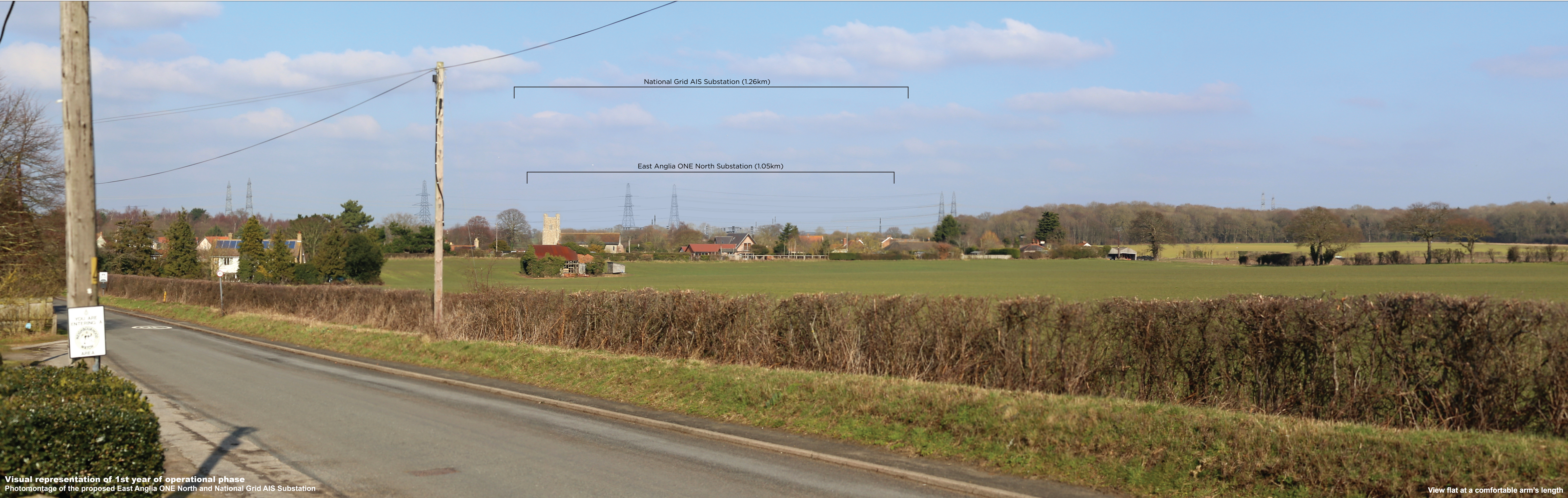
Visual representation of 1st year of operational phase Photomontage of the proposed East Anglia ONE North and National Grid AIS Substation